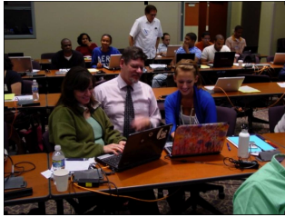
2009 Careers in High Performance Systems (CHIPS) Mentoring Workshop

January, 2009: CRA-W/CDC Programming Languages, Operating Systems and Architecture Workshop